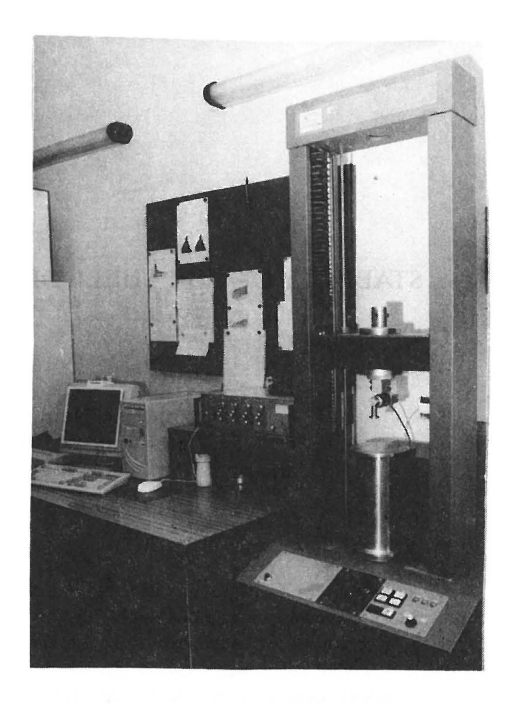
Photo 1. The equipment for measurement and evaluation of destructive power.